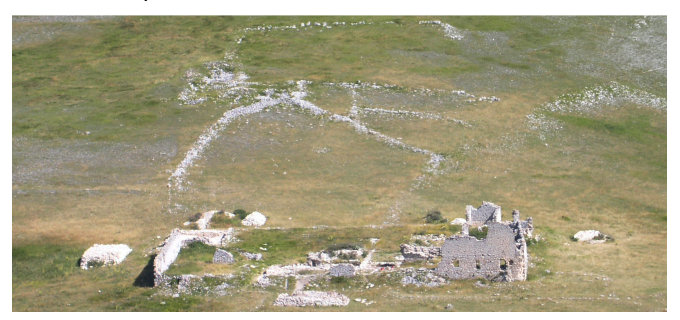
Fig. 3: The ruins of the Cistercian grange of Santa Maria of Mount Paganica, on the Gran Sasso, one of the sites selected for the activities (photo: F. Redi, June 2003).

Furthermore, and currently topical, is also the research activity and the debate around the question of vulnerability and the risk of losing the immense environmental and cultural patrimony in Italy and how this needs to be brought to the centre of attention both politically and in the private sector, being one of the most important factors upon which to re-launch the economy of the country. It is felt therefore, that the Agreement signed at L'Aquila, described in this text, represents a first step in this direction.