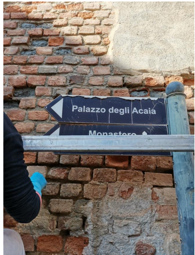
Fig. 9: Reintegration of detached bricks on the main exterior facade (R. Rudiero 2020)

The realization of all these interventions has allowed the asset to be usable again, at least in its external parts. Indeed, as of September 2020, it is periodically open to the public. This is also possible thanks to the efforts of Italia Nostra volunteers, who organize guided tours to foster a more widespread knowledge of this complex stratigraphic palimpsest. Thus, it is now part of a larger city route, a destination or crossroad of an urban-scale valorization. It also includes theatrical performances narrating the true or alleged events that occurred within the complex.