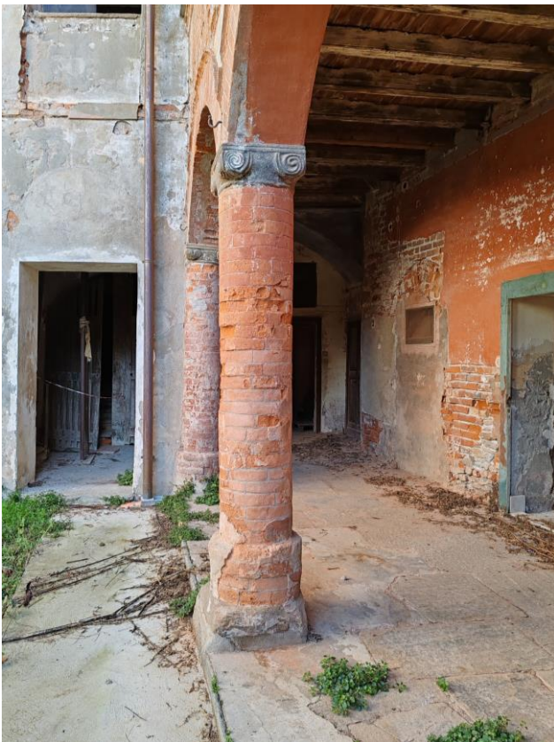
Fig. 8: The brick pillar of the porch on the ground floor, after restoration. The wooden ceiling of the covered side room has also undergone conservation work

Once this has been specified, it is essential to underline that the research carried out under the direction of the Polytechnic University of Turin was part of a broader and long-standing process, locally active through voluntary yet organically organized activities. They aimed to make the citizens aware of the values of an asset characterized by fragmentary knowledge and, above all, not properly preserved and used. So, with these renewed solicitations and the new analysis, the first restoration interventions designed to secure the Palace were carried out starting in 2019-2020. First, the roof of the south wing was rebuilt, and the wooden floor immediately below it was integrated and restored (Fig. 12). Analogous interventions were performed on the loggia floor. On its ground floor, the columns were consolidated (Fig. 8), and portions of eroded bricks pertaining to the dignified facade overlooking Via al Castello were reintegrated (Fig. 9).