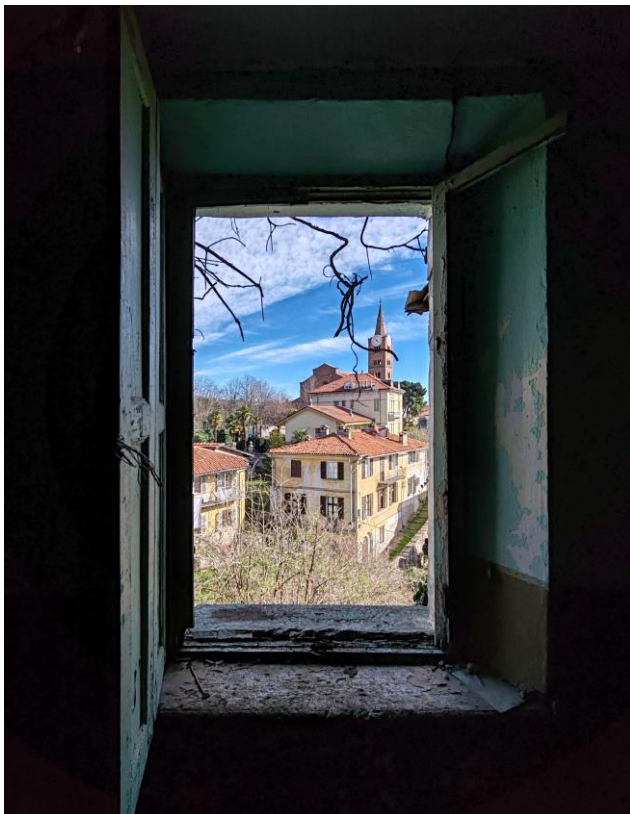
Fig. 10: View from one of the rooms on the top floor of the north wing. The proximity to the church of St. Maurizio, already part of the Borgo, clarifies the possible unintentional mystification about the Palace's ownership (R. Rudiero 2024)

Pinerolo area. By tradition and mythography – and also in a factual way (being an important architectural testimony of one of the pivotal centers of the Principality) – the Palace belongs to a specific branch of the Savoy family. Thus, in recent years, it has been involved in projects aimed at valorizing the entire territorial asset south of Turin by using the House of Acaia as a propeller for cultural tourism 7 . This occurrence had the merit of prompting new studies and research, producing a virtuous circle. This is demonstrated, for example, by the itinerant conference entitled Tutela, conservazione e valorizzazione dei beni Acaia in Piemonte (Protection, Conservation and Valorization of Acaia Assets in Piedmont), held in Turin, Pinerolo and Fossano in December 2018, organized by the Regional Council of Italia Nostra Piemonte, which also gathered several proposals on how to conserve the Palace in Pinerolo (Trombotto, 2019).