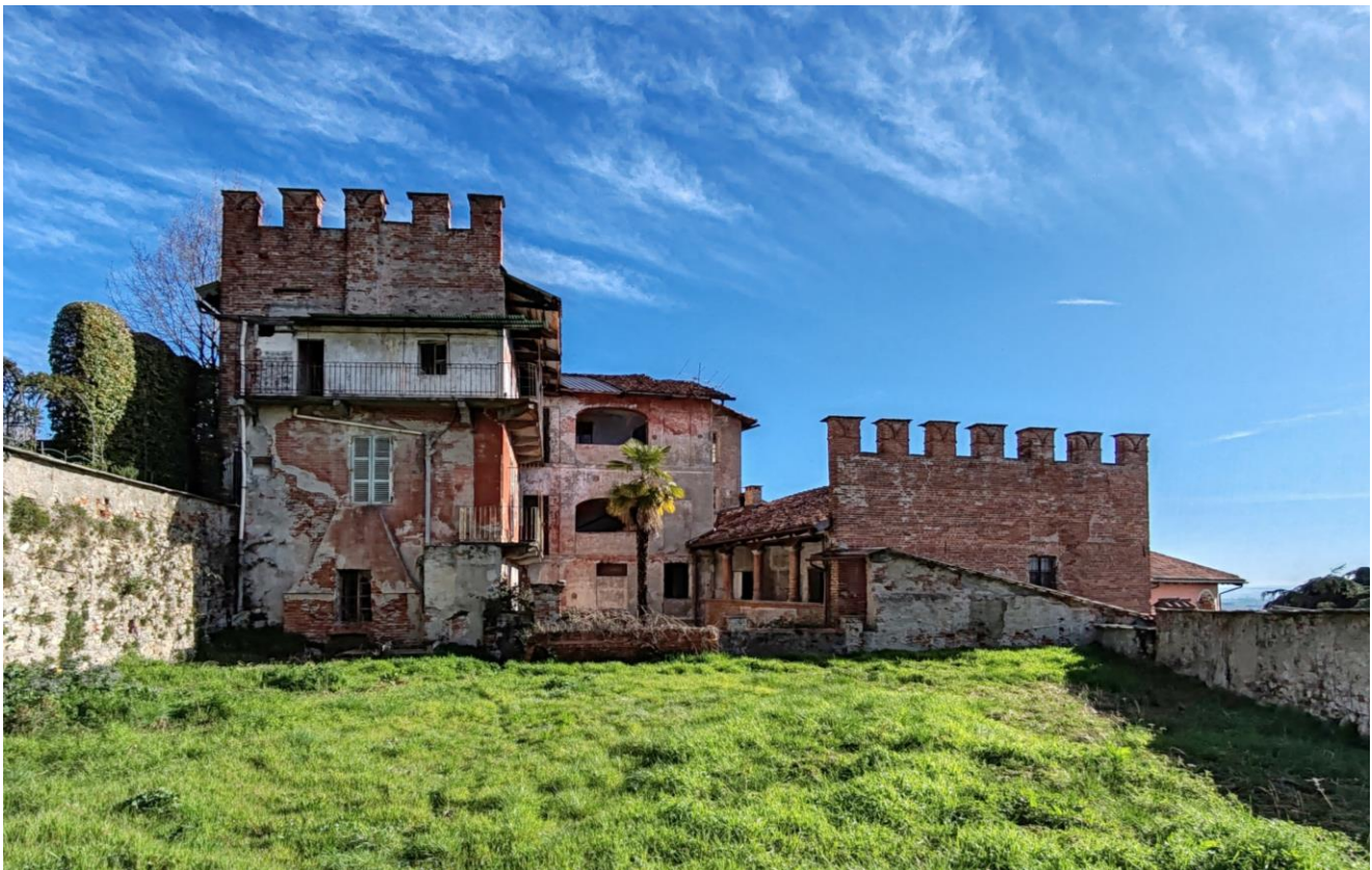
Fig. 1: Pinerolo, the so-called Palazzo dei Principi d'Acaia, seen from the garden. The building results from the amalgamation of several units, whose architectural language was later uniformed during the Renaissance period (R. Rudiero 2024).

and opportunities, risks, and the objectives of the project” (Icomos 2020, p. 36).